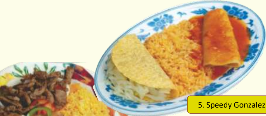
5. Speedy Gonzalez