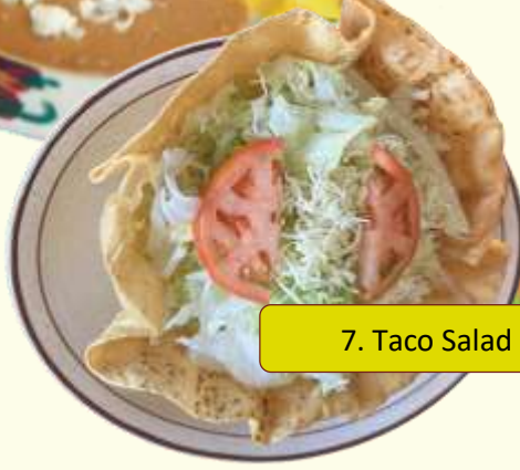
7. Taco Salad

Chips & Salsa Complimentary first basket. $1.50 additional