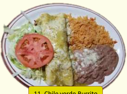
11. Chile verde Burrito