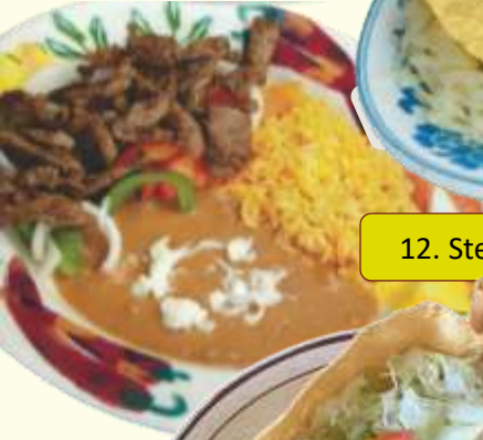
12. Steak Fajita Lunch