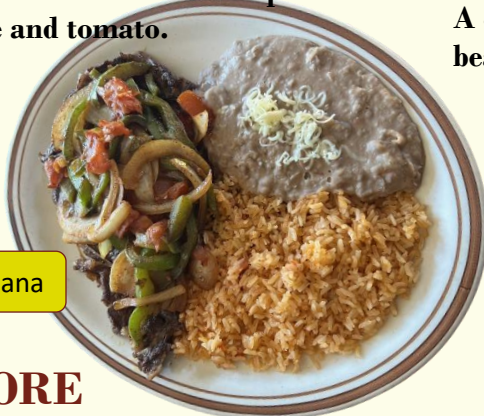
48. Steak a la Mexicana

A big burrito stuffed with rice, beans and your choice of steak or chicken with melted cheese on top. Served with sour cream, lettuce and tomato.