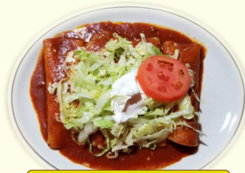
29. Enchiladas Supreme