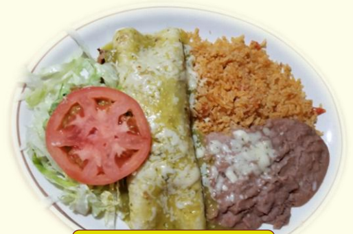
30. Burrito California