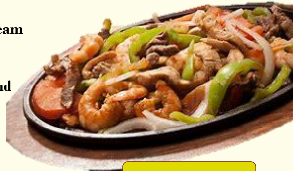
43. Fajitas Texasas

Shrimp with salsa diablo (hot sauce). Served with rice and beans.