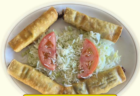
27. Taquitos Mexicanos