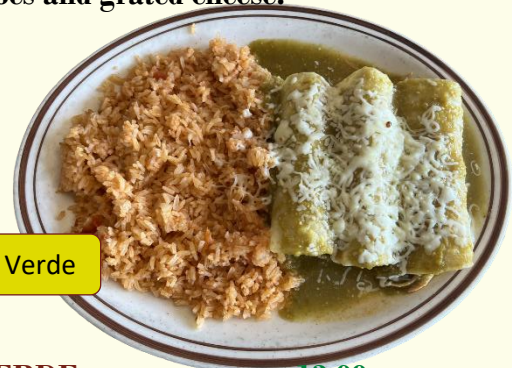
62. Enchiladas Verde

Grilled chicken breast with sautéed onions and cheese sauce on top. Served with rice, beans and flour tortillas.