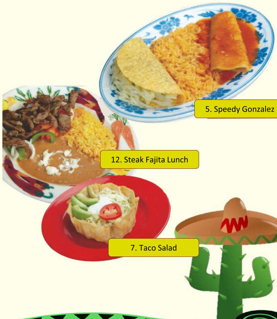
5. Speedy Gonzalez