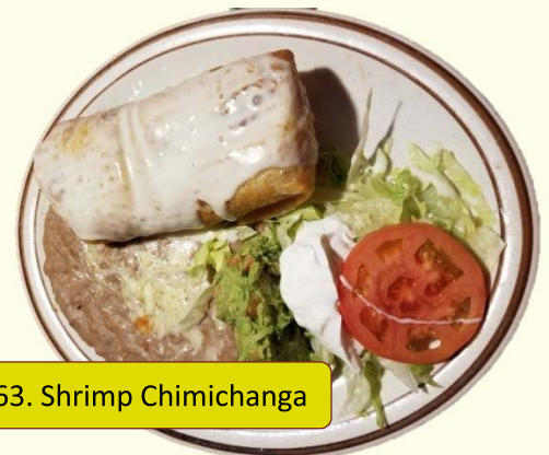
63. Shrimp Chimichanga

A crisp flour tortilla filled with steak or grilled chicken, beans, lettuce, tomatoes, grated cheese, and sour cream.