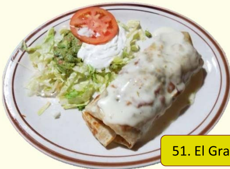
51. El Grande Burrito

A big burrito stuffed with rice, beans and your choice of steak or chicken with melted cheese on top. Served with sour cream, lettuce and tomato.