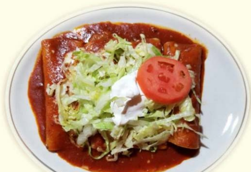
29. Enchiladas Supreme