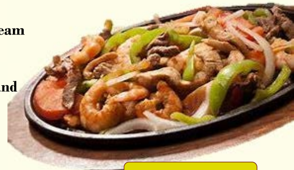
43. Fajitas Texasas

Shrimp with salsa diablo (hot sauce). Served with rice, and beans.