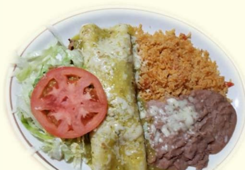
30. Burrito California