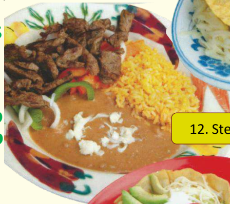
12. Steak Fajita Lunch