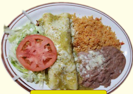
11. Chile verde Burrito

Chips & Salsa Complimentary first round. $1.50 additional