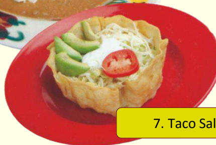
7. Taco Salad