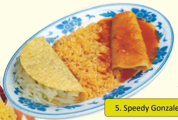
5. Speedy Gonzalez