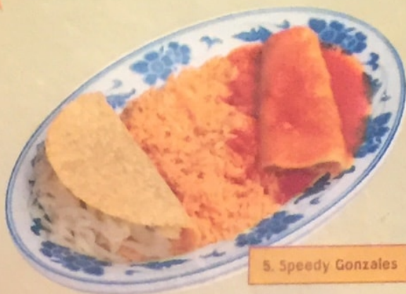
5. Speedy Gonzales